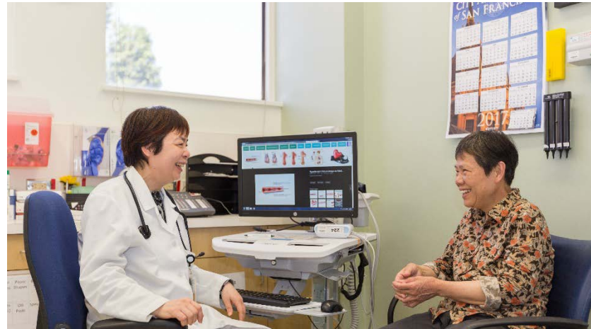
Electronic Health Record