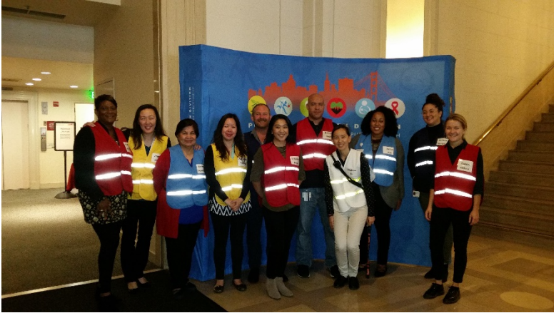
Public Health Accreditation