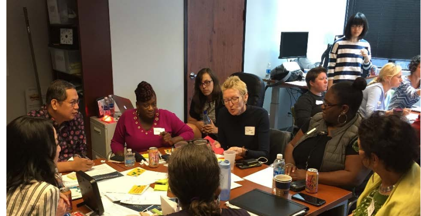
Whole Person Care Pilot